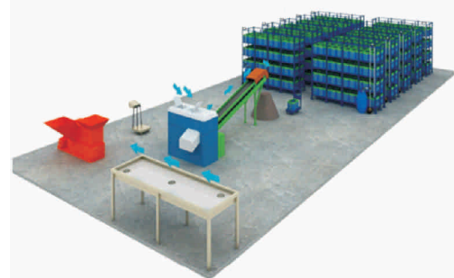
Large Scale OWC Plants with Multi-Curing System