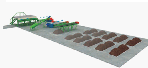
Large Scale OWC Plants with Windrows